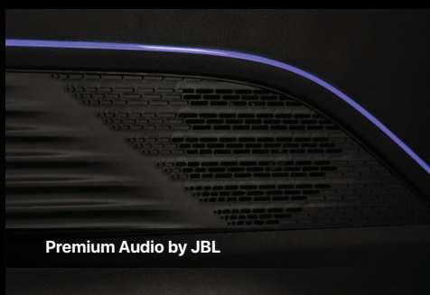
Premium Audio by JBL