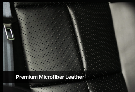
Premium Microfiber Leather