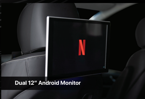
Dual 12" Android Monitor