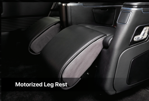
Motorized Leg Rest